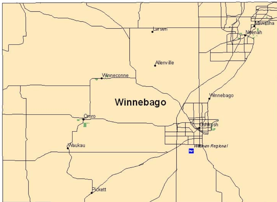
Figure 1. Oshkosh-Neenah, WI MSA

The local economic benefits generated by this level of home construction activity are reported in a separate NAHB document. 1 This report presents estimates of the costs—including current and capital expenses—that new homes impose on jurisdictions in the area and compares those costs to the revenue generated. The results are intended to answer the question of whether or not, from the standpoint of local governments in the area, residential development pays for itself.